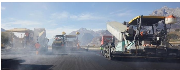
Figure 2: Installation of asphalt layers on a Swiss cantonal road.

The functional unit is defined as 1 m 2 of each layer for a Swiss cantonal road with a reference service life of 60 years. The LCA was done in accordance with the standard EN ISO 14040/44 and EN 15804+A2 using the life cycle assessment software openLCA (2.1) and the UVEK database (UVEK LCI Data DQRv2:2018).